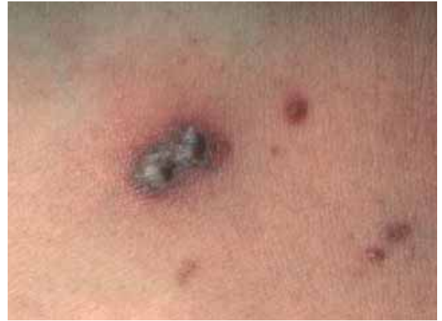
Figure 1. Papular purpuric and ulcerative-necrotic skin lesions.

A skin biopsy was performed from a papular lesion and histology revealed leukocytoclastic vasculitis with a high number of eosinophils in the dermal inflammatory infiltrate (Figure 2). Immunohistochemical studies revealed expression