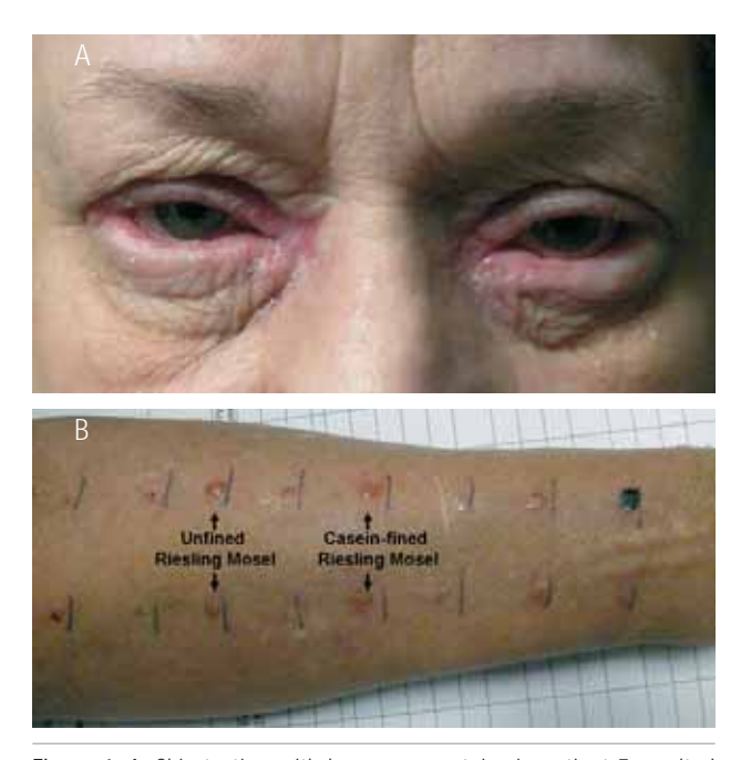
Figure 1. A, Skin testing with hen's egg proteins in patient 5 resulted in rhinoconjunctivitis, swelling of the eyelids, periorbital pruritus, and angioedema. B, The result of the skin prick test in patient 9 was positive to undiluted casein-fined as well as to unfined control Riesling Mosel with no significant differences.

The SPT with all test wines fined with ovalbumin and lysozyme was performed in 3 of 5 egg-allergic patients (3 patients \times 7 fined wines). One patient could not be tested because of eczema on both forearms, another refused to take part after having experienced an anaphylactic reaction due to the SPT with egg protein, egg fining agents, and Riesling Rheingau (Table 2, patient 5, Figure 1A). She developed angioedema, pruritus, conjunctivitis, eyelid edema, and rhinorrhea 30 minutes after the SPT, which resulted in strongly positive reactions (wheal diameters >12 mm) to albumin, lysozyme, and egg proteins, but not to wine. The