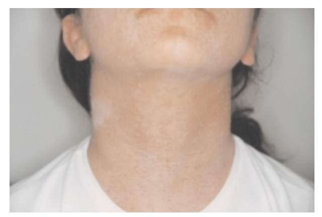
Figure 1. Pustular erythematous eruption on the third day of hospitalization.

wheezing. She was hospitalized and blood samples were taken for routine examination, including mononucleosis and rubella–rubeola serology. All medications were stopped and cold compresses were applied for the fever.