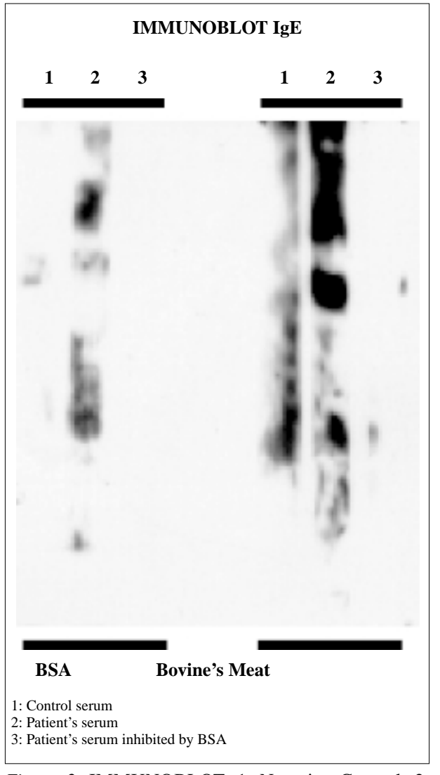
Figure 2. IMMUNOBLOT. 1. Negative Control. 2. Patient serum. 3. Patient serum inhibited by BSA.

Intradermal BSA test (5 mg/ml) was positive (7.5 mm), and it was negative in 5 healthy controls.